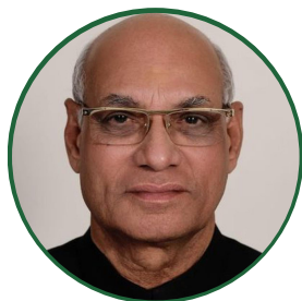
Shri Ramesh Bais

Hon'ble Chancellor HSNC University, Mumbai Governor Of Maharashtra